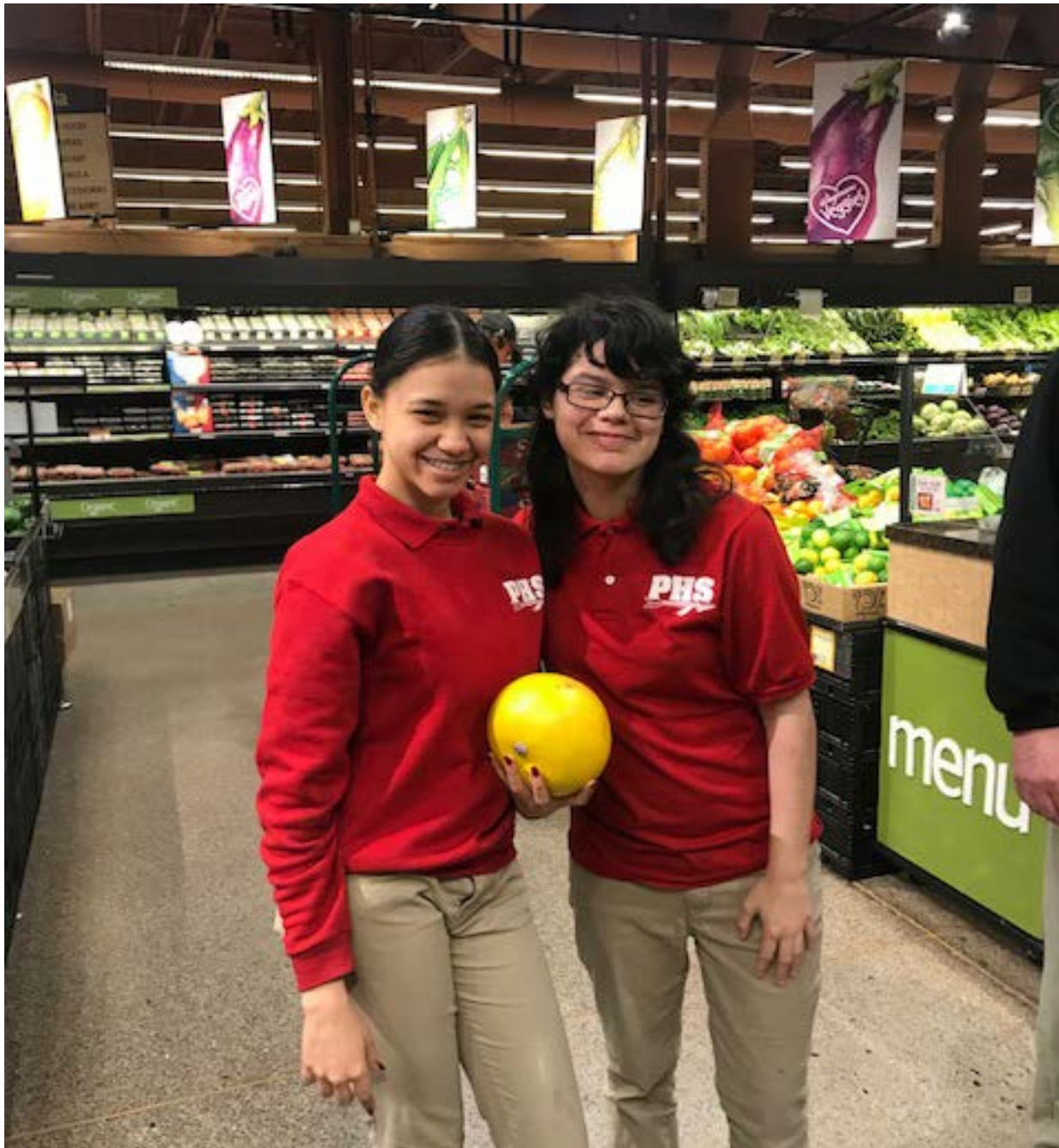
PENNSAUKEN HIGH SCHOOL AT MT. LAUREL WEGMANS

Self awareness is conscious knowledge of one's own character, feelings, motives, and desires. By incorporating self awareness into the lesson on self advocacy students learn how to be unique and understand themselves better.