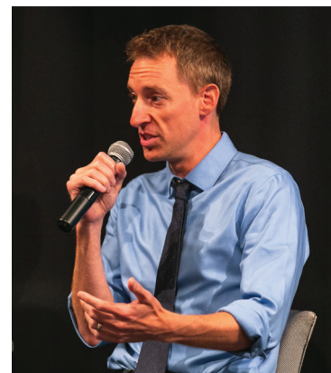
Jason Kander discussed mental health and the importance of managing trauma.

Support JFS programs making a difference in our community by donating to the JFS Friends of the Family Annual Fund. Go to jfskc.org/donate and select Friends of the Family Campaign in the Designation field.