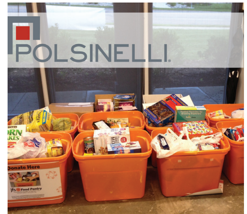
Polsinelli Law Firm made sure JFS could stock the pantry this summer thanks to their food drive and lemonade stand.