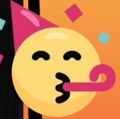
JFS LiVE! GALA

HOW TO CHOOSE AND ENGAGE YOUR BOARD TO BE MORE