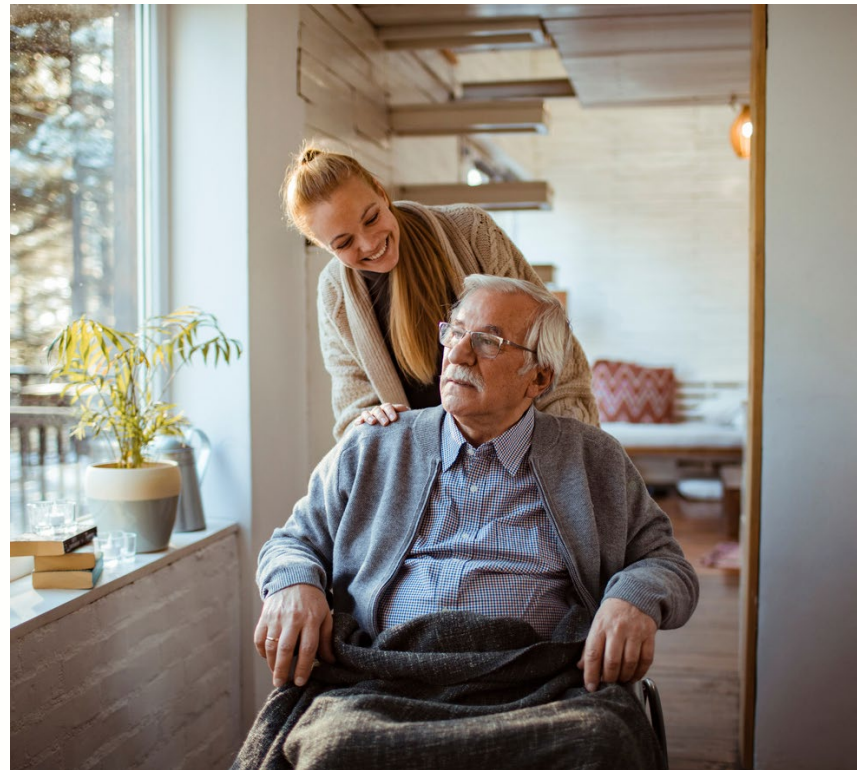
Older Adults Department