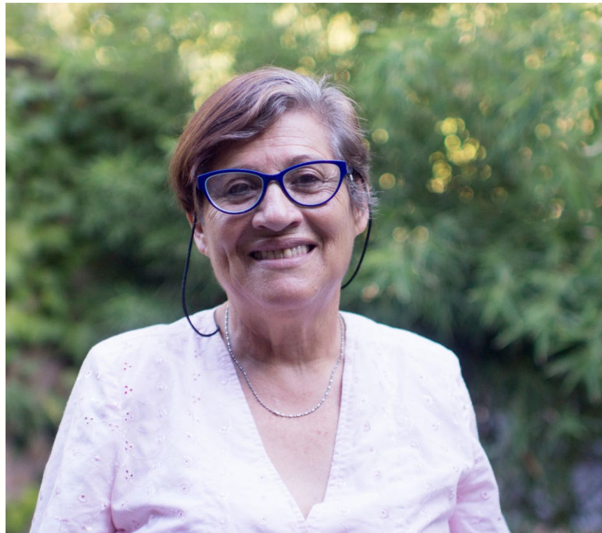
Holocaust Survivor Care Program